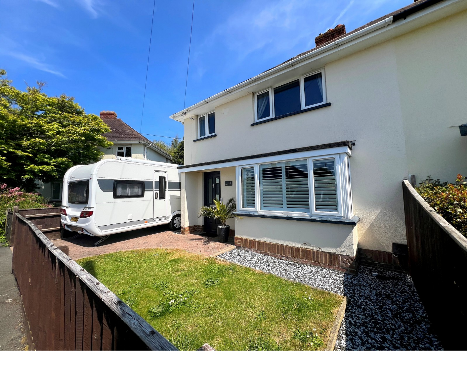
43 Fawcett Road, New Milton, Hampshire. BH25 6SU