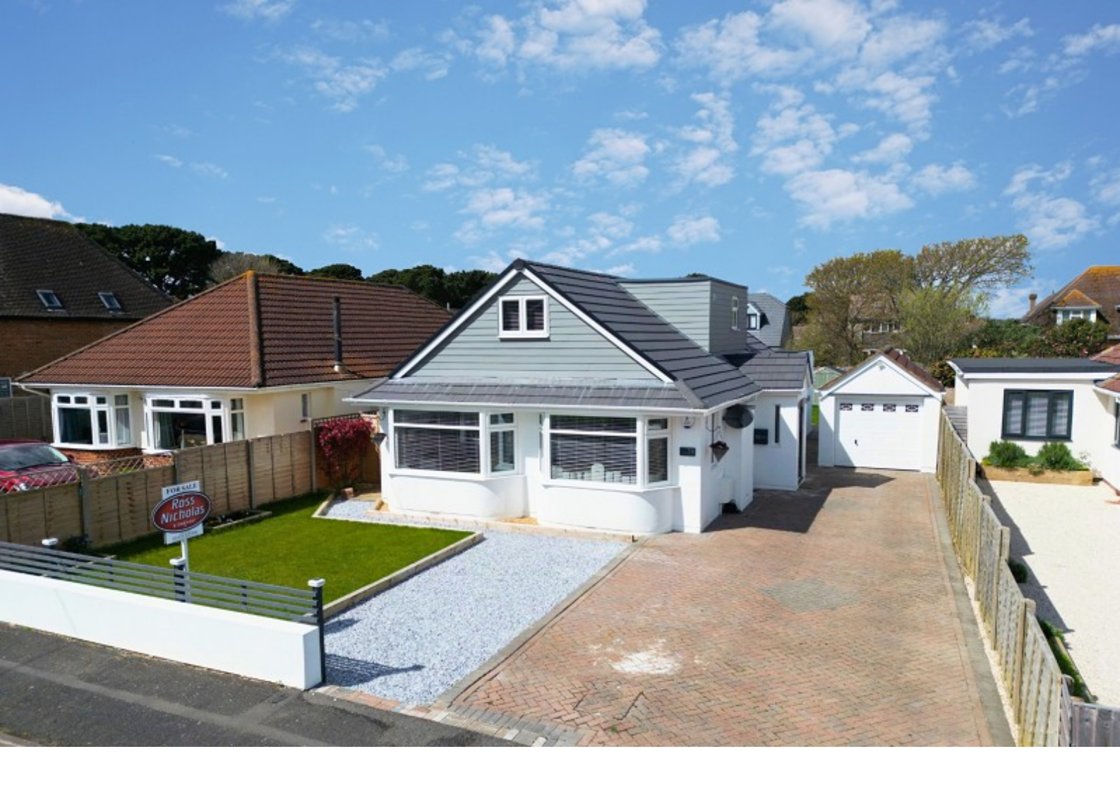
18 Naish Road, Barton On Sea, New Milton, Hampshire, BH25 7PU. Guide Price £825,000