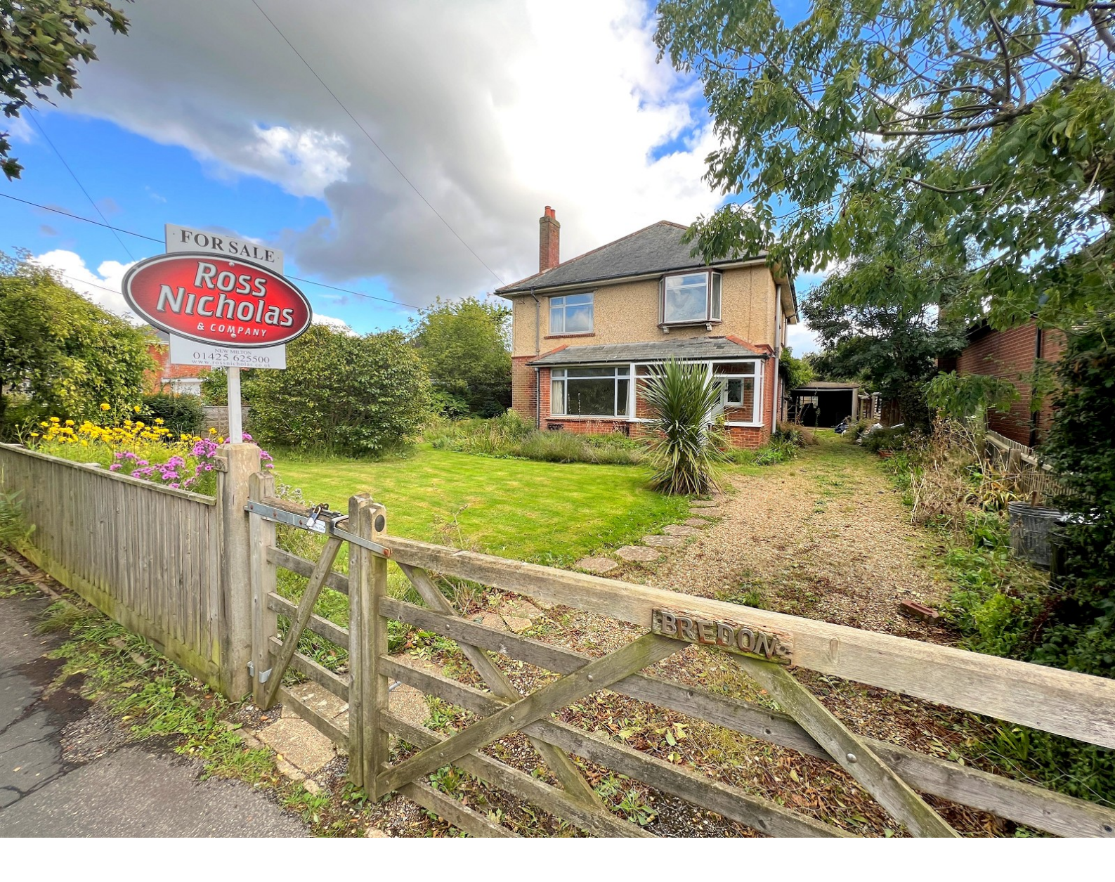
Bredon, 43 Barton Court Road, New Milton, Hampshire. BH25 6NW Guide Price £599,950