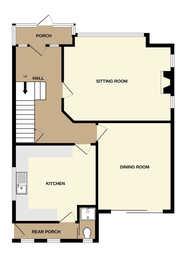
GROUND FLOOR 746 sq.ft. (69.3 sq.m.) approx.