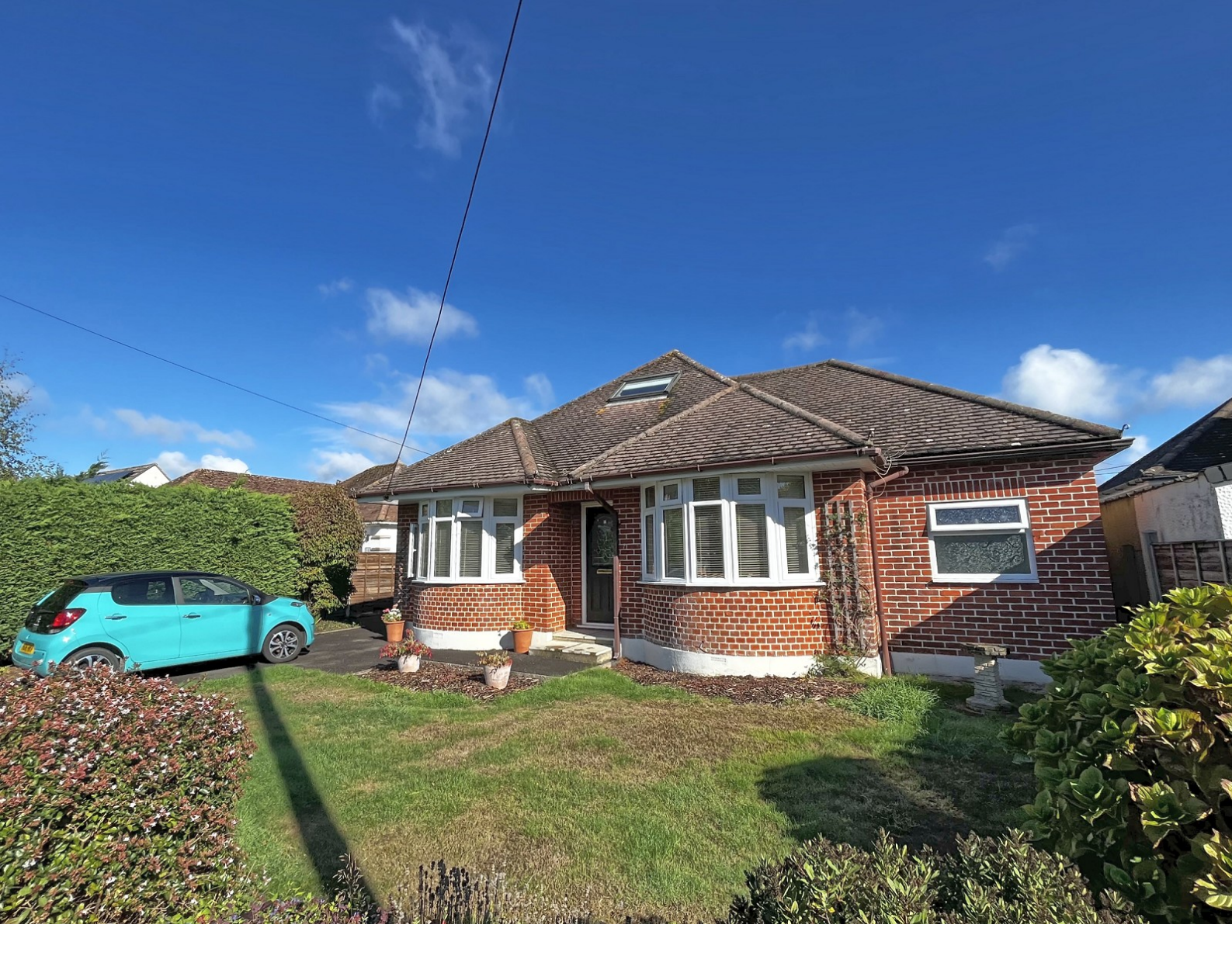
22 High Ridge Crescent, New Milton, Hampshire. BH25 5BU Guide Price £459,950