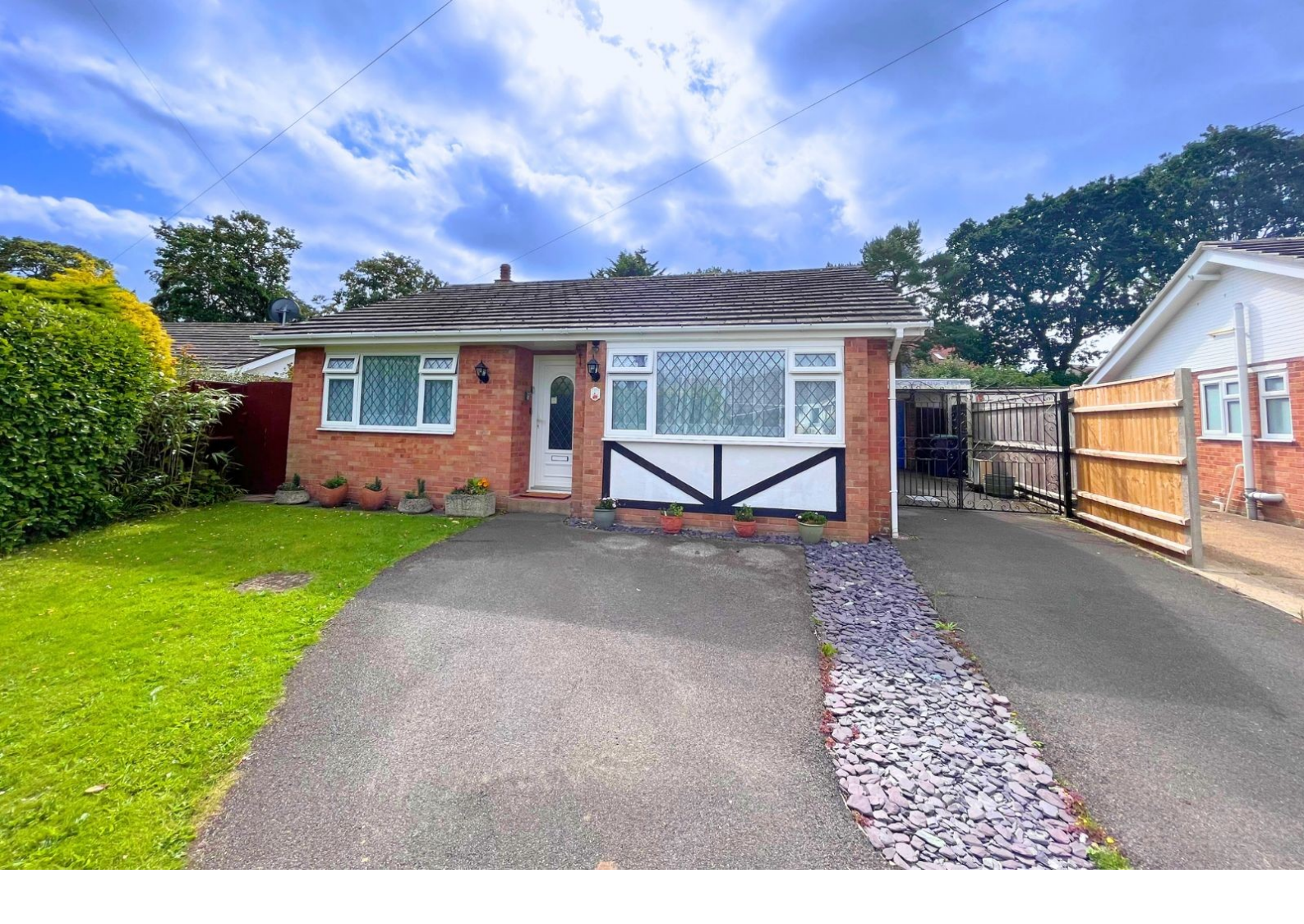
11 Clive Road, Highcliffe, Dorset. BH23 4NX £465,000