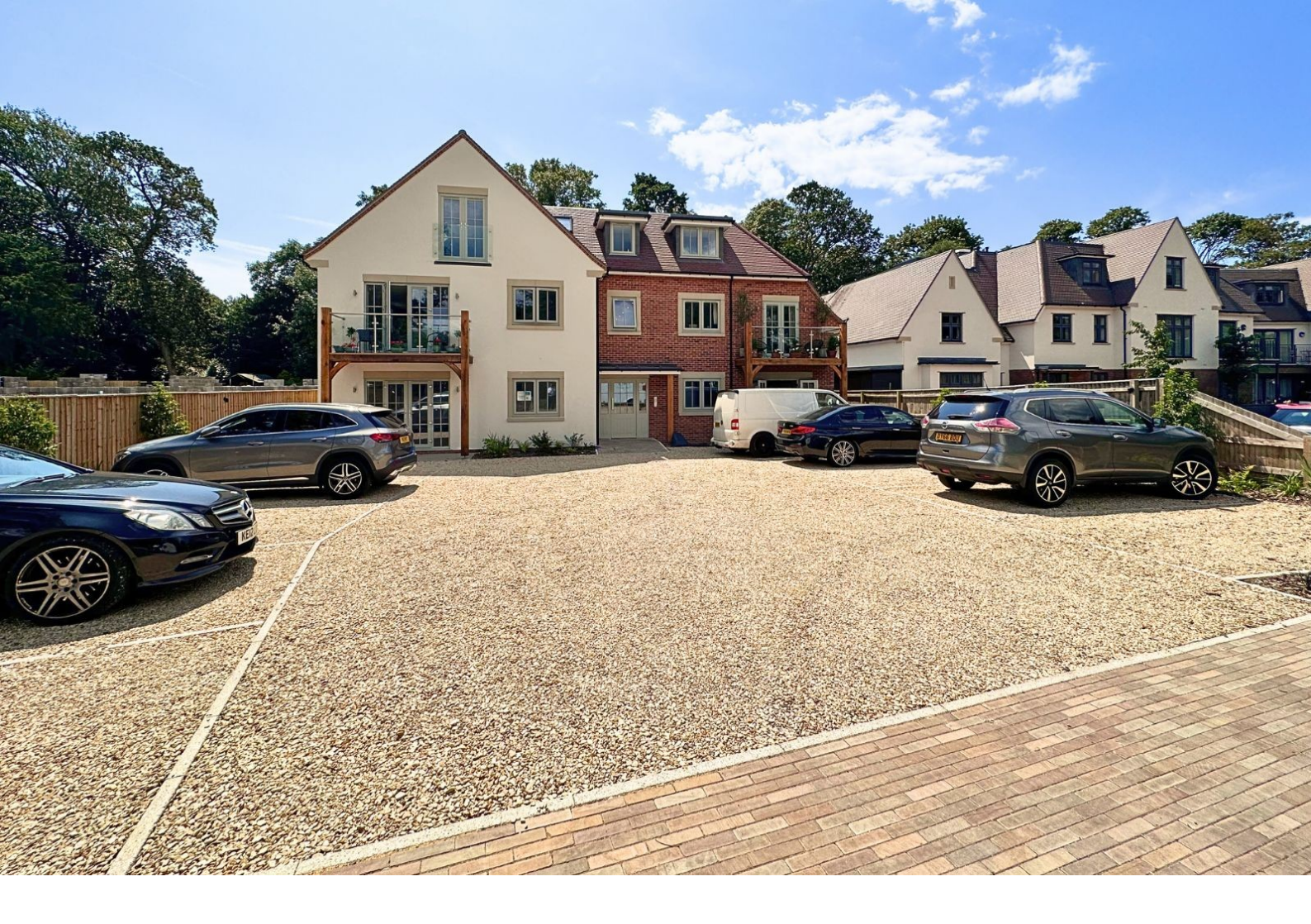
Apartment 6 Castle Rise, Lymington Road, Highcliffe, Dorset. BH23 4JS £350,000