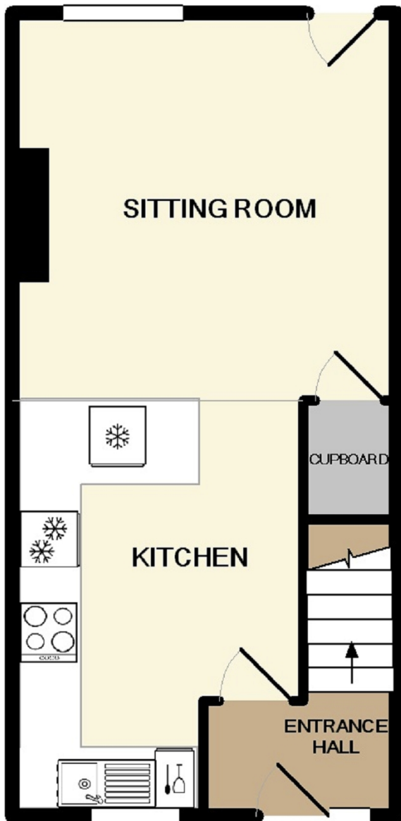
GROUND FLOOR APPROX. FLOOR AREA 314 SQ.FT. (29.2 SQ.M.)