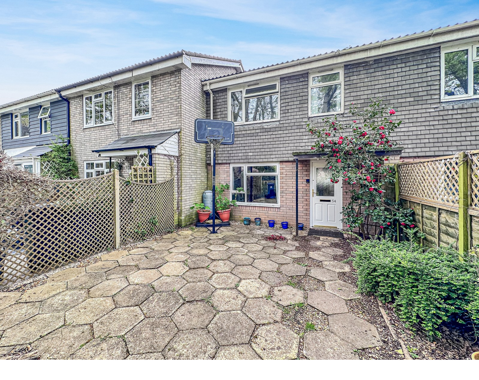
54 Plantation Drive, Walkford, Dorset. BH23 5SQ