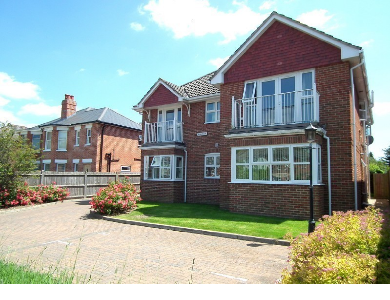
Flat 2 Maple Court 52 Manor Road, New Milton, Hampshire. BH25 5WS Guide Price £230,000